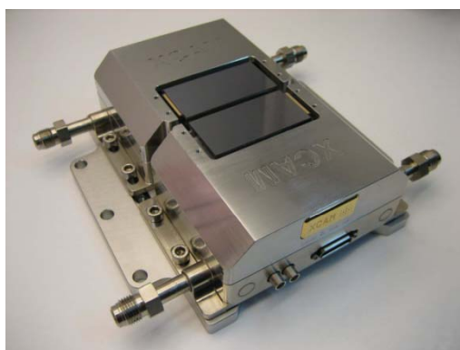
Figure 1 Large Dual Unit Camera with Adjustable Central Slit

Xcam specialises in producing custom and prototype CCD cameras for leading-edge science experiments all over the world. On request, Xcam produced a peltier and water-cooled camera that can house the e2v Technologies CCD42-90 or CCD44-82 sensors for an XFEL experiment.